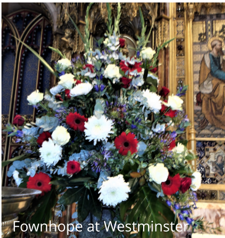
Fownhope at Westminster